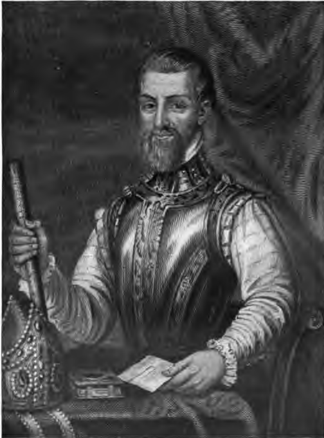
PEDRO DE LA GASCA, VICEROY OF PERU